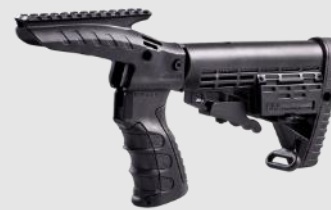
Pistol Grip & Upper Picatinny Rail, Buffer Tube & CBS Stock