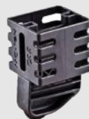
Magazine Coupler For OEM Metal Magazines