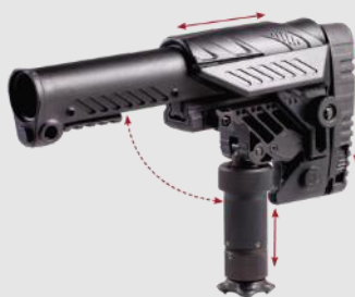
Multi Position Sniper Stock