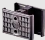
Magazine Coupler For MP5