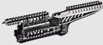
5 Picatinny Hand Guard Rail System