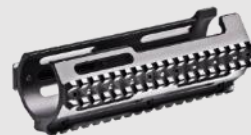
3 Picatinny Hand Guard Rails Systems