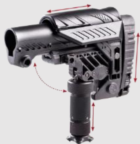
Multi Position Sniper Stock