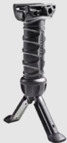
Pivot Pod Grip