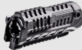
3 Picatinny Hand Guard Rails Systems