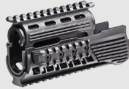
4 Picatinny Rails Handguard System, Top & Bottom Parts.