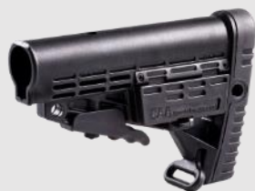
Collapsible Butt Stock