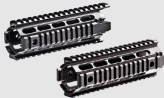
Picatinny Quad Rail.