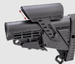
Integrated stock and adjustable cheek-rest