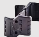
Magazine Coupler For CAA Metal Magazines