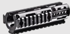
3 Picatinny Rails Handguard Rail