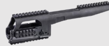
4 Picatinny Rails Handguard Rail System.