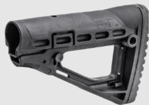
Skeletonized Butt Stock