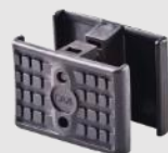
Magazine Coupler For AK47