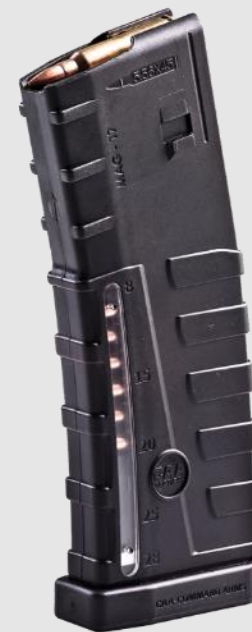
Indicative 30 Rounds Magazine